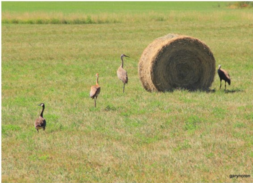
Fam and family in hay field.