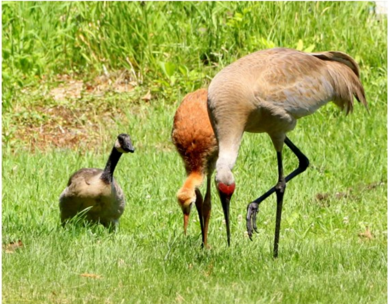
Fam, sandhill crane sibling Sam, and one of the crane parents.